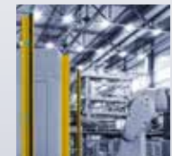
Safety Light Curtains