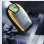
Hand Held scanners