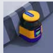
Safety Laser Scanner