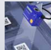
Stationary Industrial Scanners